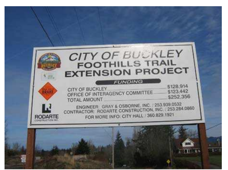
Now we arrive at the trails of the green triangle, i.e. the green contractor + green government + green Futurewise