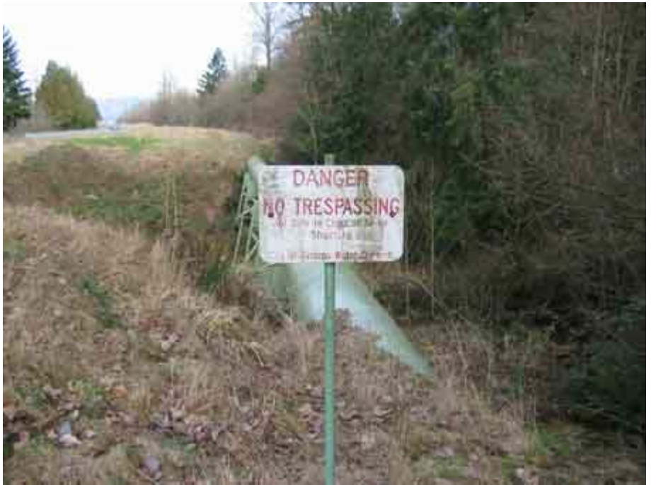
Danger lurks along the Trail of Tears