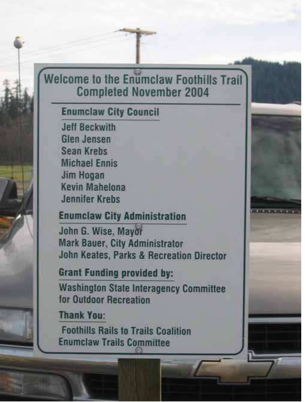
Here is the hall of shame in Enumclaw, WA.

These type of people either do not have a clue and/or do not care about the trail of tears, suffering and taking they are creating. The collateral impact of their ignorant decisions upon the adjoining private property owners over whelms any common good. Never mind the horror, loss, suffering and legal engagement all the property owners must go thru as each city and county government shark culls them out, one by one, taking advantage of them. The property owner becomes the salmon swimming up stream; the government bear is on a feeding frenzy.