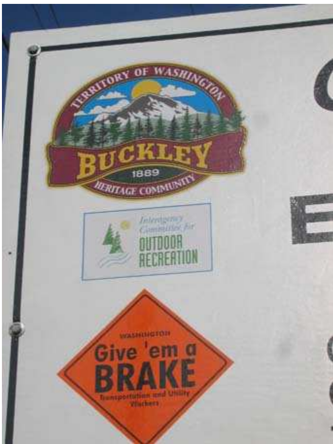
$252, 356 for a 12' wide paved dead ends path from Buckley to the White.