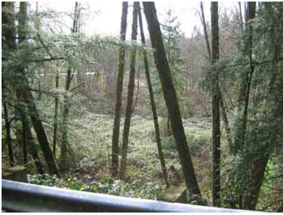
Trails over swamps, trails over Mud Mountain road

Trails thru wetlands, trails thru aqueducts, trails thru natural gas, trails of fools. Rural land owners cannot do anything with their buildings or land, at the same time they are forced to pay unconstitutional property taxes and have their wages and land stolen while the state, county and city government corporations build trail over swamps and rivers.