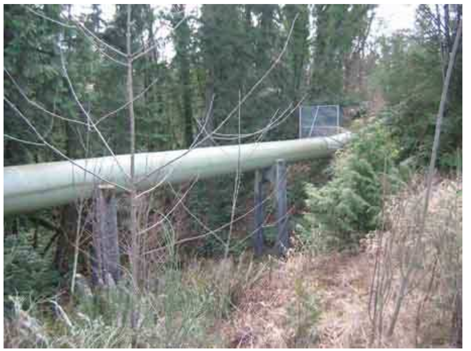
The trail of nonsense not common sense.