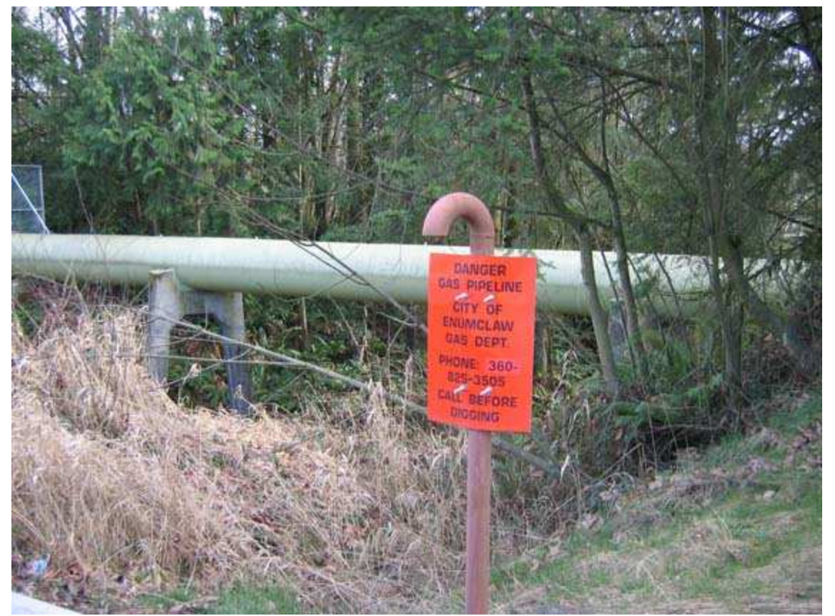
Gas lines, water aqueducts, gorges, private property, all add up to more tears of taking